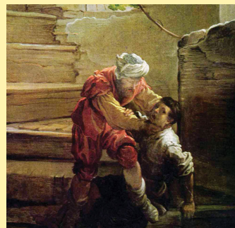
Detail of The Unforgiving Servant (Matt 18:21-35) by Dominic Fetti (c.1589-1623)

It has been found in various studies that